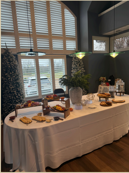
Had a wonderful Open House to show off our renovations!