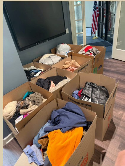
Thanks to your generous donations, we had a successful coat drive for All For Him Ministries!