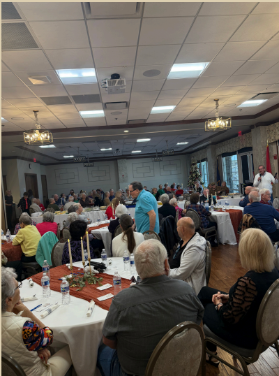
Thanksgiving Luncheon at Del Webb!